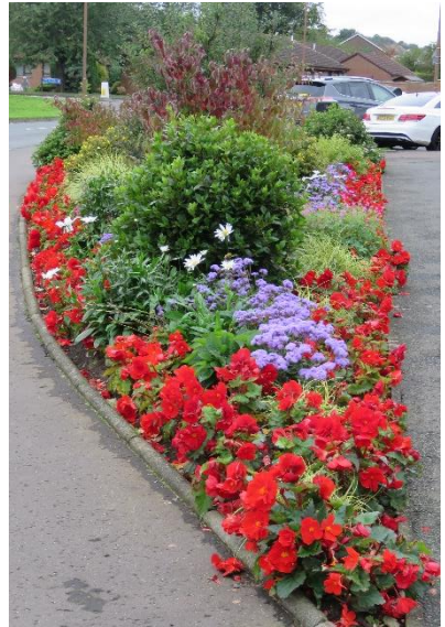
The ‘Spar’ Bed at Springfield.

C. Dovecot Park Community Garden* – Some distance along Springfield Road, turn left into Dovecot Park at the end of which you will find a raised area of ‘landscaping’ which has very recently been adopted by local residents and planted with a mix of permanent and seasonal planting with the assistance of Burgh Beautiful.