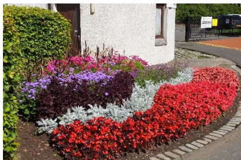
Flower beds in front of Low Port Primary School (left) and the Low Port Centre (right).