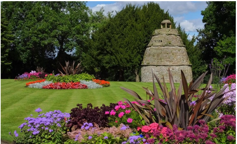
Mixed planting and the Ross Doocot in Learmonth Gardens.