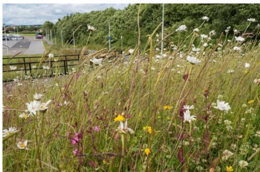
Wild flowers at the ramp up to the Union Canal.

K. Lennox Cairn* – On the left, just before the next roundabout, is an impressive display of permanent and seasonal planting which gives an attractive setting for the Lennox Cairn, a memorial related to the Battle of Linlithgow Bridge.