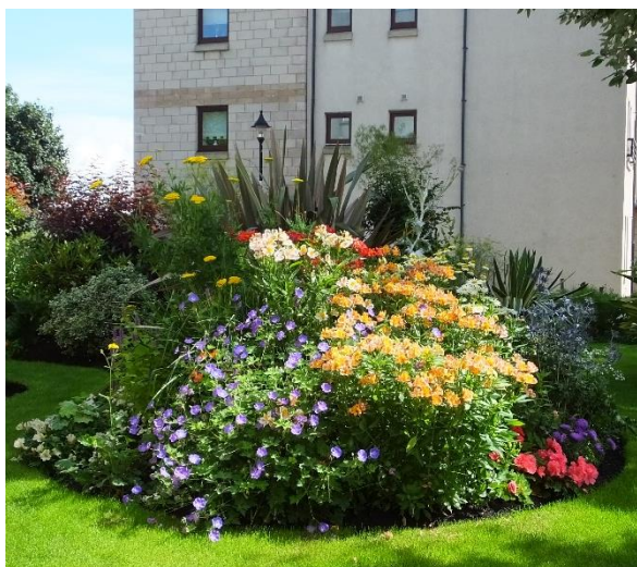
Audrey Simpson's Community Garden at the St Ninian's Road flats.

14. Water Yett Community Garden* – Turn left along the lochside and shortly you will see on the left the stunning floral displays provided by Eileen Murray and fellow residents of the Water Yett flats. Take time to examine in detail the variety of plants, providing both colour and wildlife habitats and all the examples of decorative public art, plus some 'edible' planting!