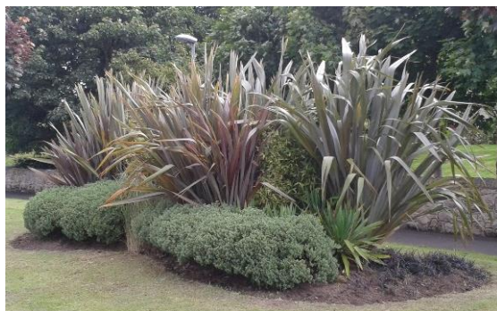
High-impact permanent planting, Kinloch View.