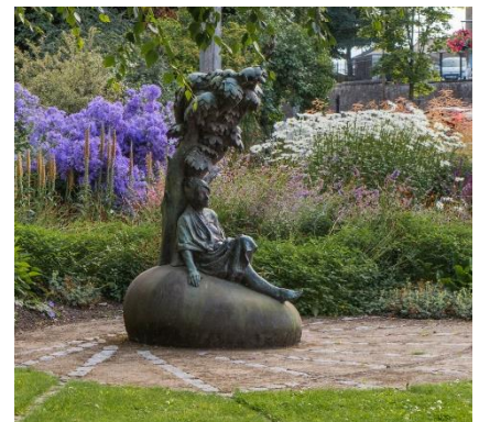
Binny Plants' display of perennial plants around the 'Katie Wearie' artwork at the West Port.

19. 'Katie Wearie' Displays – On the opposite side of West Port, across the pedestrian crossing, is a mixed herbaceous bed planted by Binny Plants of Ecclesmachan (Billy Carruthers) and maintained with the help of Burgh Beautiful volunteers (photograph on right). This provides a setting for the 'Katie Wearie' sundial sculpture by Tim Chalk. Beyond the large willow tree on the left (known as Katie Wearie's Tree) is another mixed bed maintained by Burgh Beautiful*.