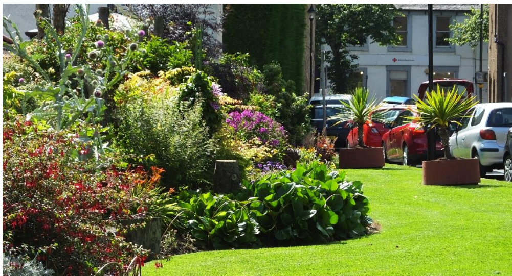
Eileen Murray's Community Garden at Water Yett.

14. Water Yett Community Garden* – Turn left along the lochside and shortly you will see on the left the stunning floral displays provided by Eileen Murray and fellow residents of the Water Yett flats. Take time to examine in detail the variety of plants, providing both colour and wildlife habitats and all the examples of decorative public art, plus some 'edible' planting!