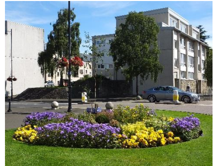
'Rotary' bed at the West Port.

17. West Port Rotary Bed – Across the road is a circular bed maintained by the Rotary Club of Linlithgow Grange – mainly shrubs and a tree in the centre, but adorned with annuals in Rotary colours around the edges.