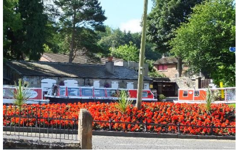
Colourful bedding at the Canal Basin.

3. Learmonth Gardens* – On the opposite side of the street to the north is Learmonth Gardens which contains eight flowerbeds, the most prominent of which mirror the type of planting in the canal-side bed while the others contain a mix of herbaceous and annual planting in coordinated colours and forms, including bee-friendly species. The entrance is flanked by a pair of North American Liriodendron trees (“Tulip trees”) and recent additions include flowering cherries and an information board relating to the Ross Doocot.