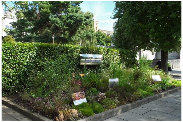
Left: Floral enhancement around St Michael's Well, High Street. Right: Transition Linlithgow's 'Protect our Peatlands' bed, at the Vennel, predecessor of this year's World War I display.

11. High Street and Cross Planters* – Continuing westwards along the High Street to The Cross and beyond, note the large number of floral planters, generally containing a central conifer and a profusion of trailing and bushy annuals.